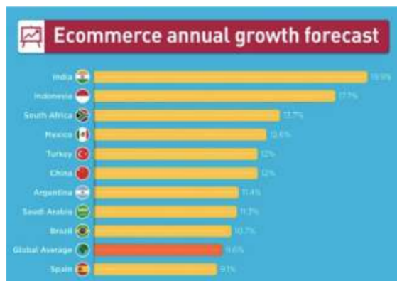
Table 1. E-Commerce annual growth forecast

Prediction The potential for e-commerce growth in Indonesia is extraordinary, ranking second after India. If this prediction is correct, e-commerce will cover many trade commodities. Currently, e-commerce can cover electricity payments, credit payments, clothing payments, zakat payments, animal sacrifice payments during Eid al-Adha; even very personal drug orders are also covered through e-commerce. Nowadays, it is enough for people to carry out trading activities, both selling, and buying, with the help of internet media. With e-commerce, trading activities become easy, flexible, can be done anytime and anywhere without being limited by time and place. For example, if someone wants to buy a book or buy a magazine, then that person does not need to go to a bookstore, but the transaction can be done with the help of the internet. Payments can be made non-cash by debiting cellular credit via SMS facility.[3]