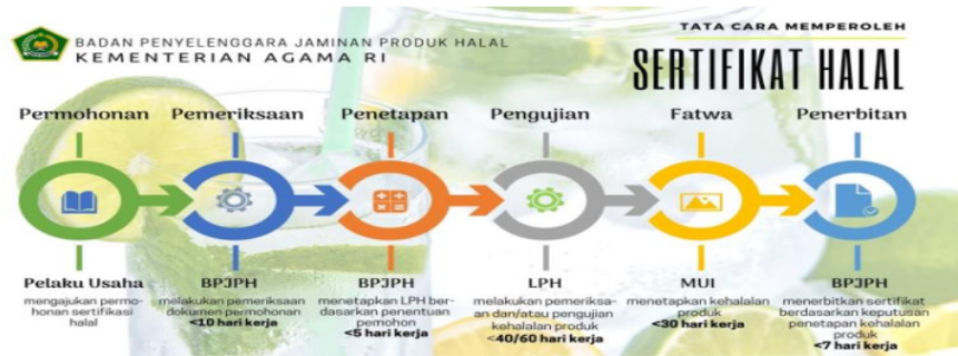
Figure 1. The Halal Certification Procedure

Producers can apply for product certification through the procedure stages as stated in the Halal Assurance System (HAS). The Halal Assurance System is a mechanism that producers must implement when applying for halal certification, which includes 11 halal criteria before being tested at LPPOM MUI. Recognition of the halalness of products by MUI guarantees Muslim and non-Muslim consumers of the halalness of the product, in order to provide a sense of security and calm in consuming the product (Baharuddin, et al. 2015). Consciousness of halalness will have a positive influence on consumers' desire to buy and use (Hapsari et al. , 2019). The halal certification procedure implemented by BPJPH are the following stages: