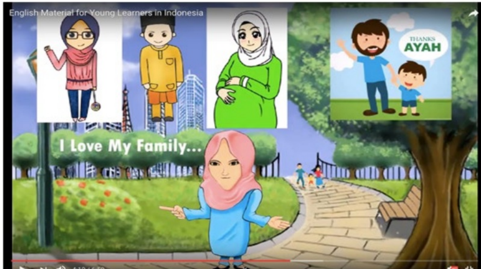
Picture 1. Video Animation Product as the result of research development using ASSURE models