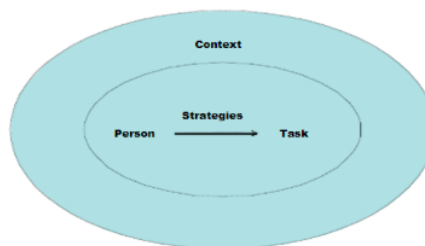
Figure 1 Person-Task-Context-Strategies (Gu & Johnson, 1996)

Considerably more research has been conducted to define language learning strategies (LLS). For example, as seen in his explanatory model (Figure 1), Gu and Johnson in Ng, Azizie, and Chew (2021) have gone deeper into a task's perspective in defining LLS. To complete a language task, a person needs to use strategies so that the learning can be much easier. Also, it could be seen that strategies used by a learner could be determined by the context, which means that different learning contexts may result in different strategies being used to complete the same task. For example, beginner and advanced students may use different approaches in knowing and remembering the words to understand collocations in vocabulary. Hence, no matter the task, it is acceptable for the learners to use whatever types of language strategies they find most interesting and useful. It can be seen in Figure 1.