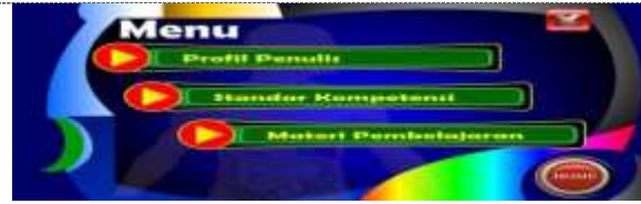
Figure 3. Main Menu Display