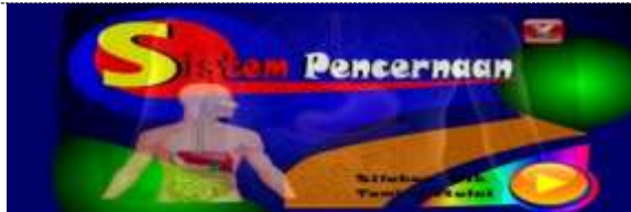
Figure 2. Front view of interactive multimedia learning media.