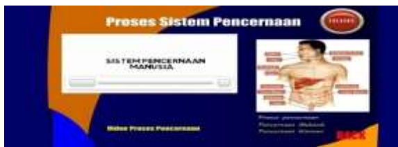
Figure 4. Display Learning Materials