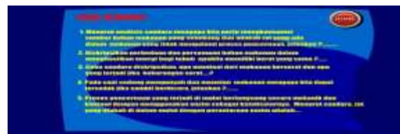
Figure 5. Display of Student Discussion Questions